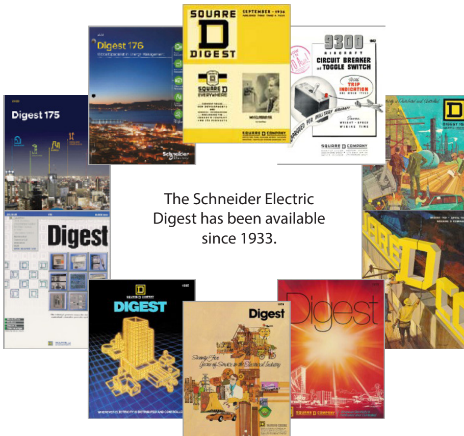
The Schneider Electric Digest has been available since 1933.